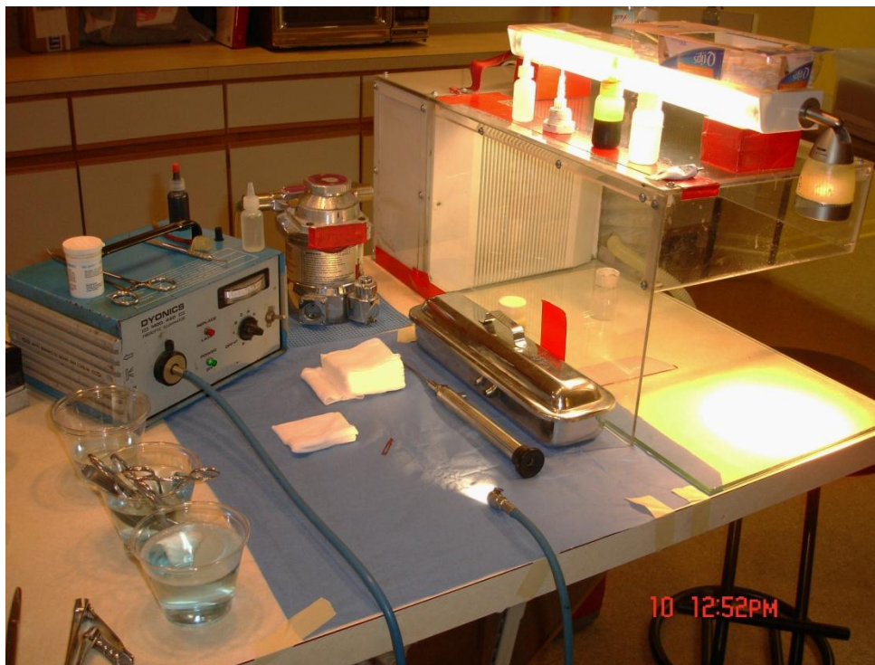
Table setup showing exhaust hood, lighting, vaporizer, sterile drape, and instruments

I use a smooth, plastic, portable table (Lifetime) purchased from an office supply store. It is 4 x 2 feet, which just fits in my car. The tabletop is impervious and easy to disinfect. I also bring my own swivel chair with extra padding. All procedures are done while seated.